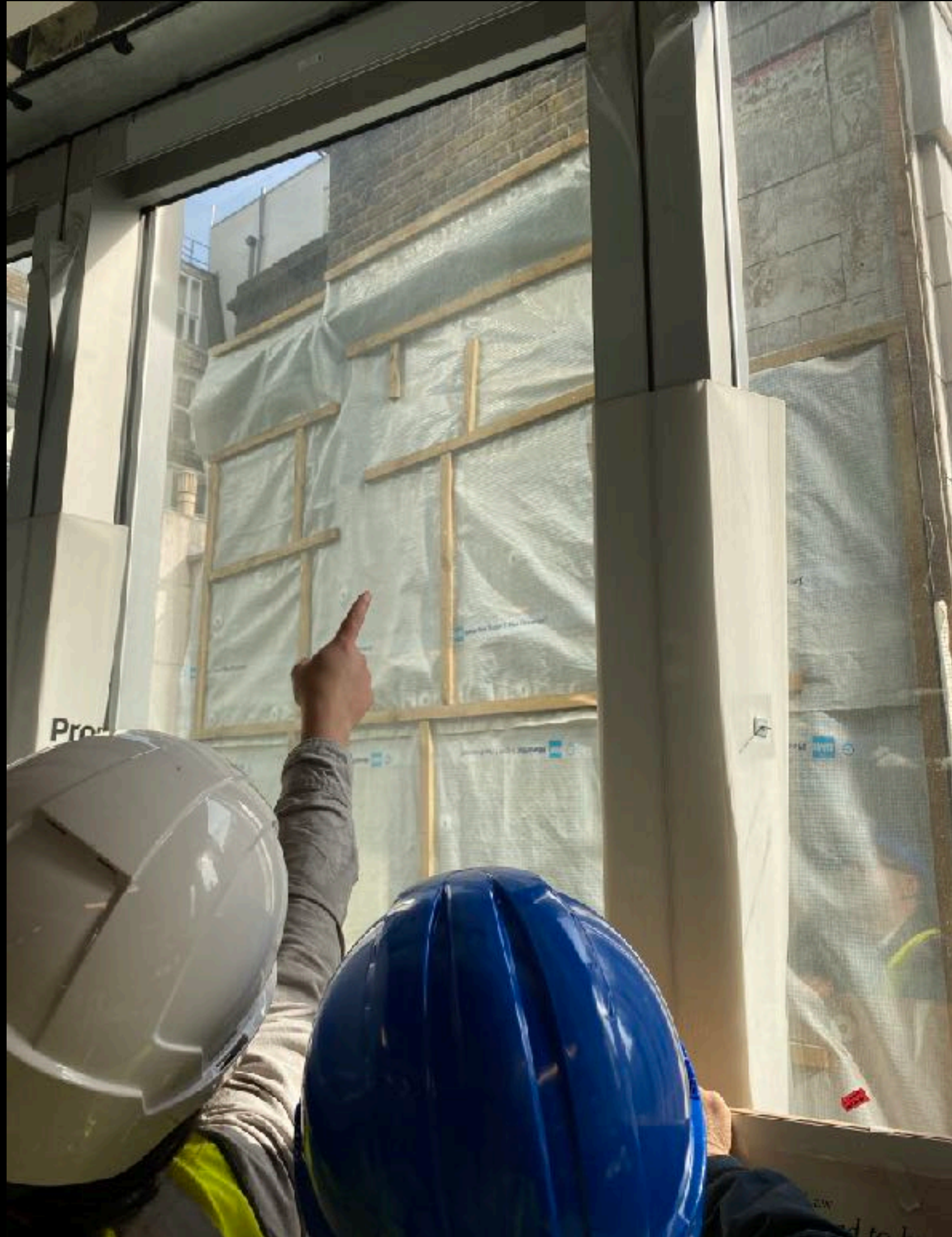
Top vantage point of the wall