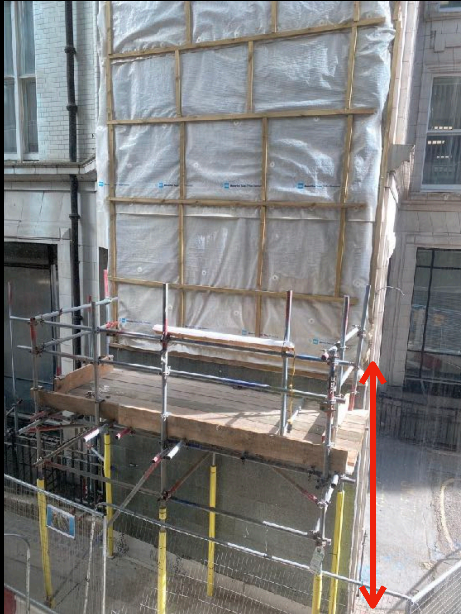
Artwork begins 3.5m above ground level.