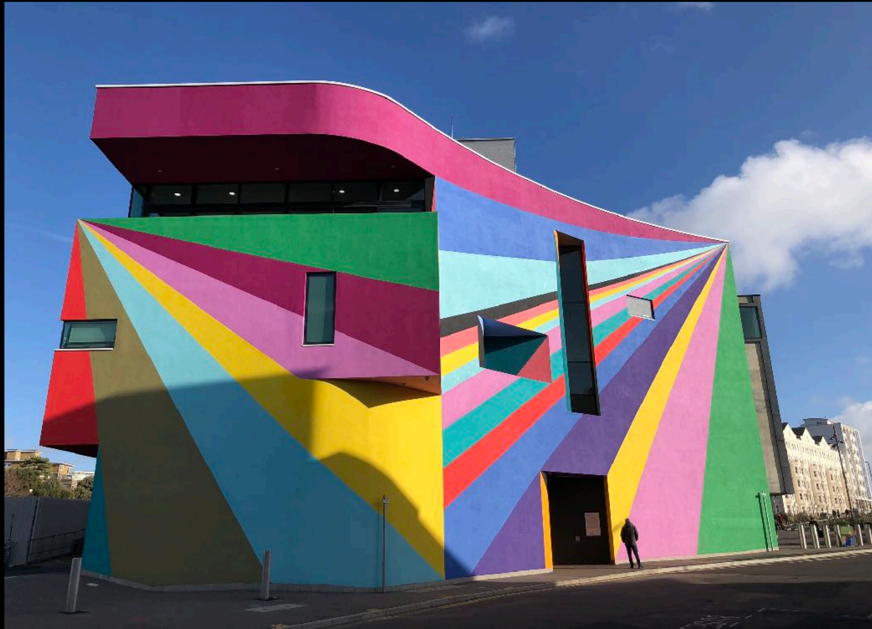
Lothar Götz: Dance Diagonal, 2019. Brewers Towner Commission, Towner Art Gallery, Eastbourne.