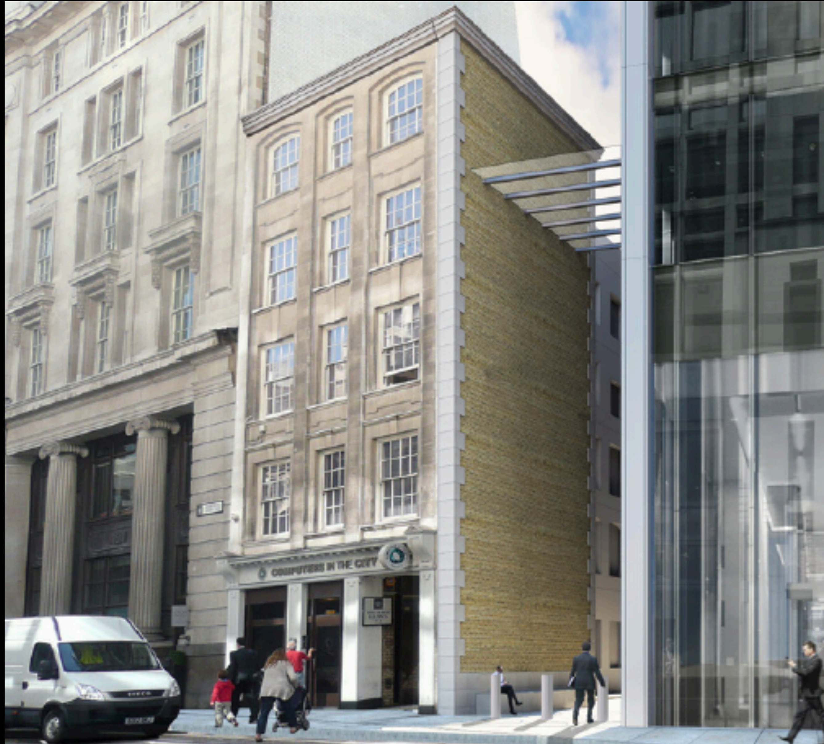
Furnace House Façade