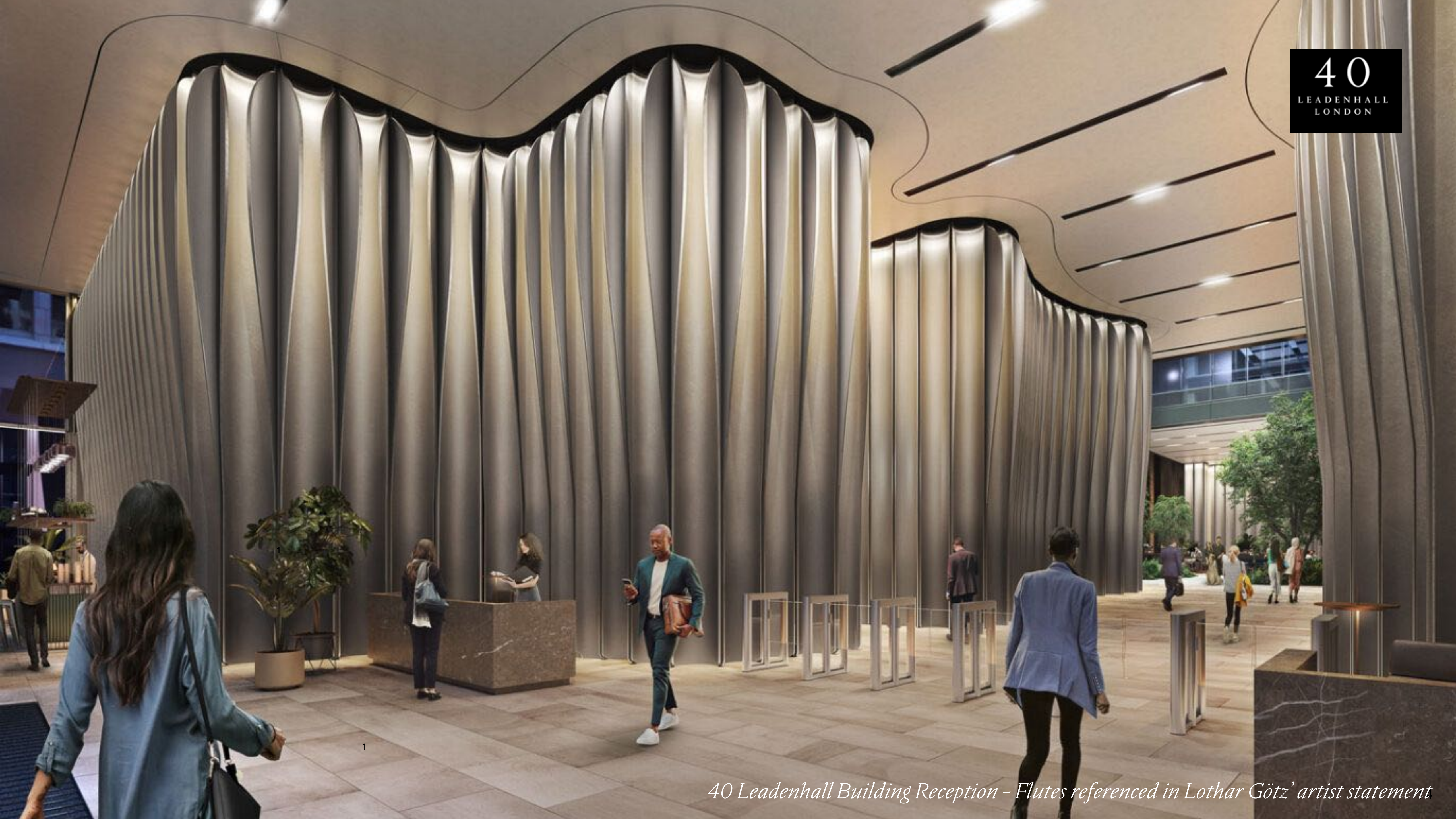
40 Leadenhall Building Reception - Flutes referenced in Lothar Götz' artist statement