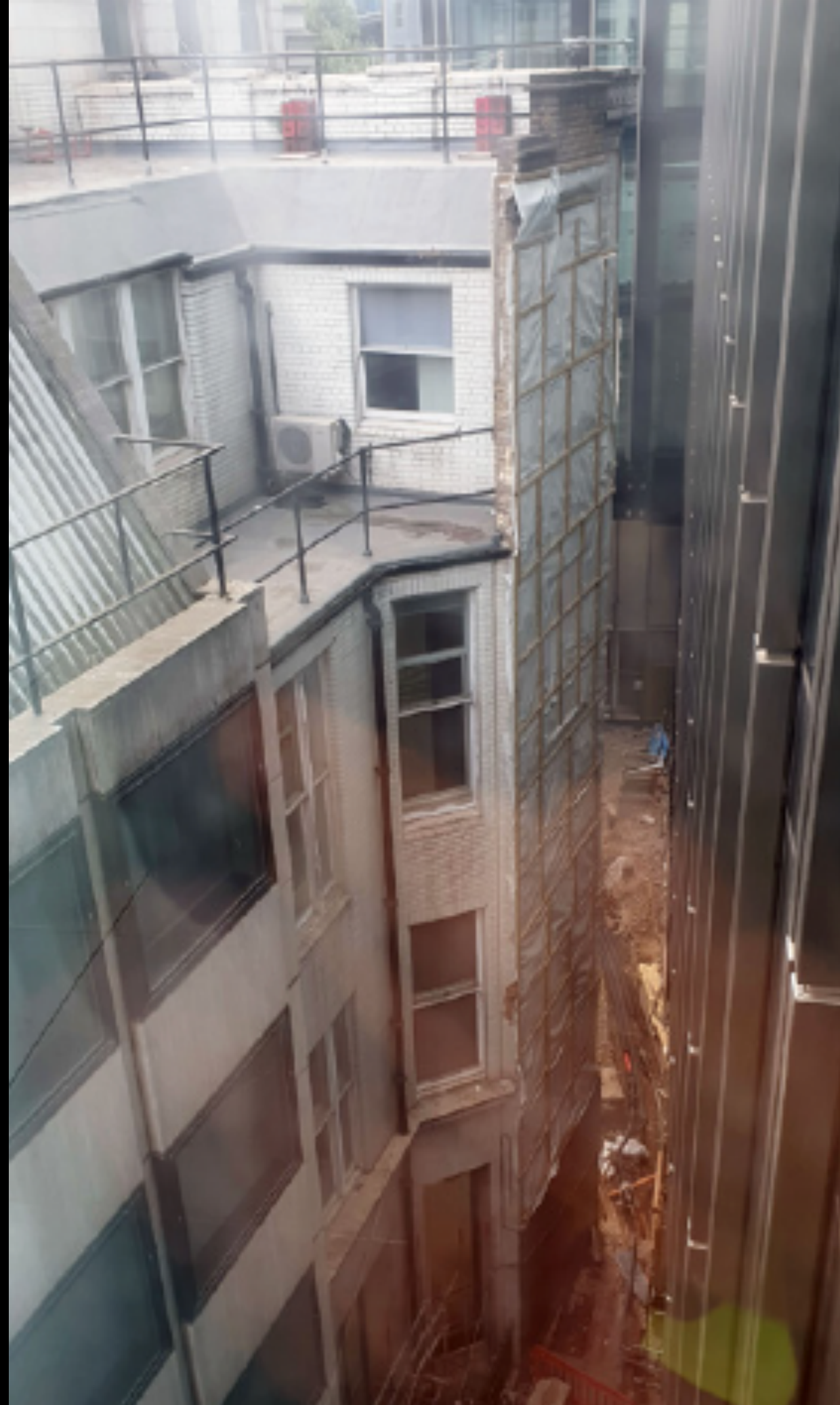
Looking North/Down to Furness House