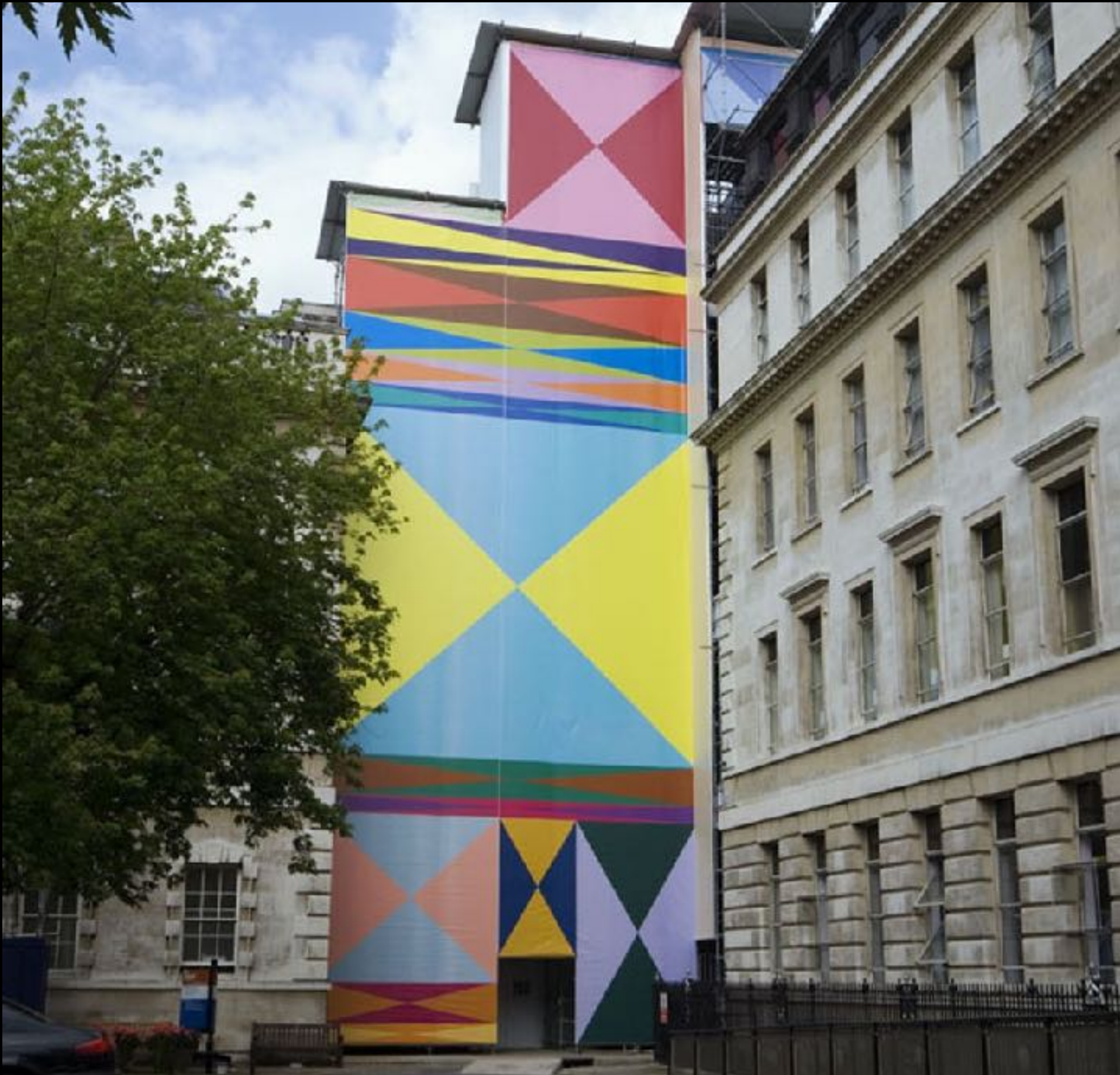
Pojagi, June 2007, temporary commission, St Bartholomew's Hospital.