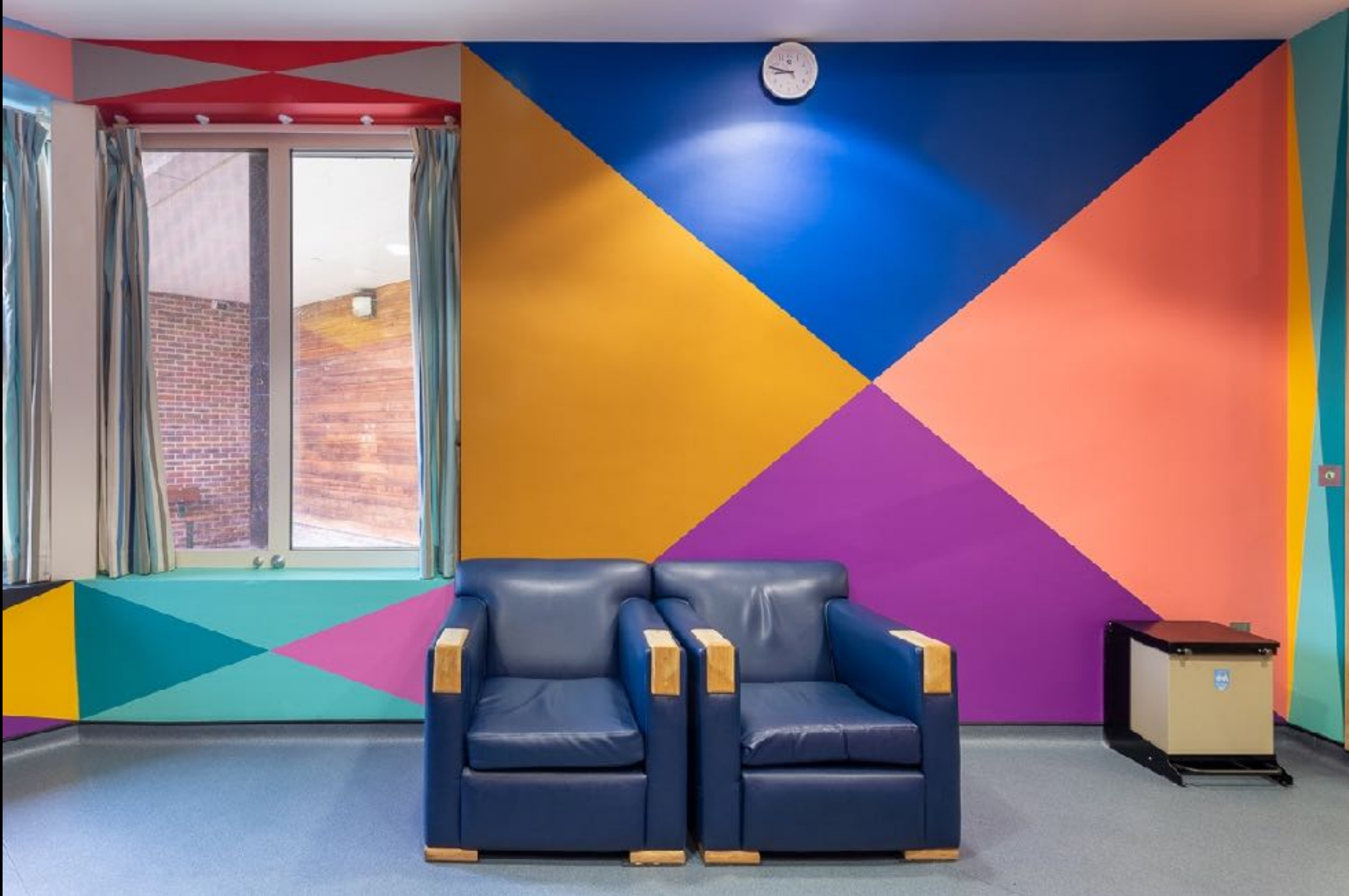
What Makes Boys Dance, 2019, permanent commission Hospital Rooms Commission for the TV Room, Oak Ward, Hellingly Centre, a closed forensic male mental health unit, NHS Foundation Trust Mental Health Hospital.