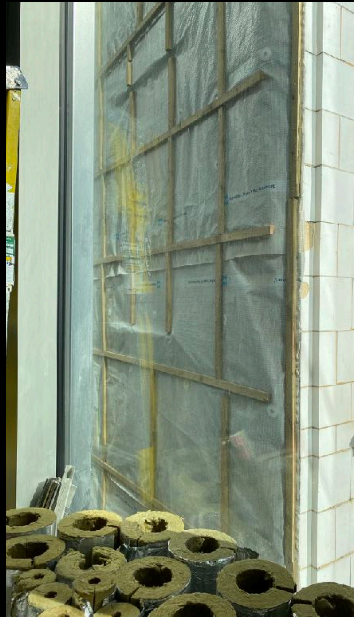
Mid vantage point of the wall