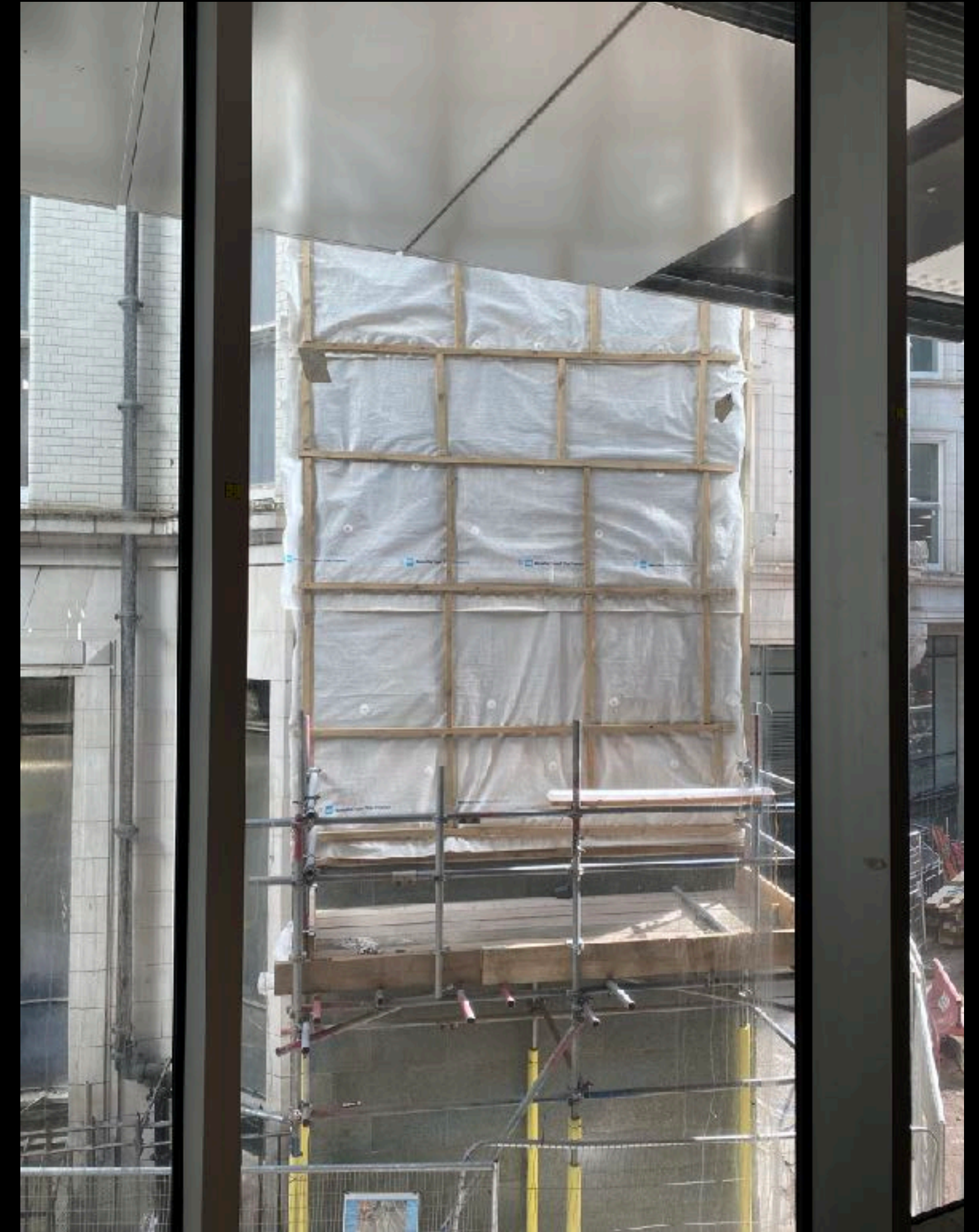
Lower vantage point of the wall