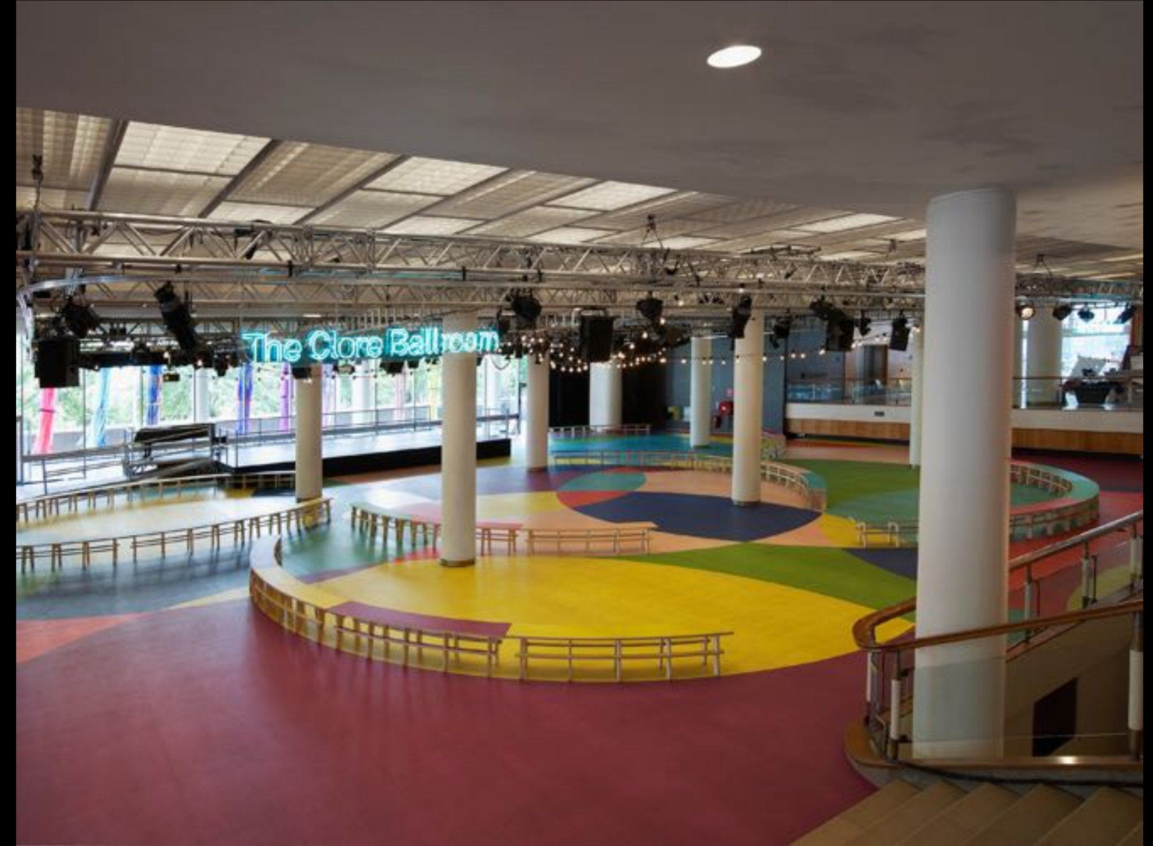
I Have a Dream, acetate on window, temporary commission, Festival of Love, South Bank Centre, Queen Elizabeth Hall 2014